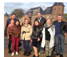
Participants from Youth-R-Well.com and Poland and Romania at the meeting in Amersfoort in May 2015

It was great to see how everyone was highly motivated and how this meeting also contributed to empowering young volunteers. I hope Poland and Romania will soon be able to develop their own online youth platform, and hopefully other countries will also benefit from the guide we wrote.