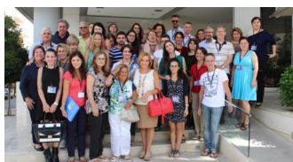
Participants at the 2015 AGORA Annual Conference

Between 25 – 27 September 2015, AGORA held its annual conference in Heraklion, Greece, entitled “Patients’ Rights to Better Health Care: Highlighting the different approaches for treating RMDs”. The conference was very successful and the participants had the opportunity to engage in very constructive discussions, as well as to participate in more practical workshops. Amongst the topics discussed were: the economics of rheumatoid arthritis; and the benefits of multidisciplinary care for people with RMDs, in combination with complementary non-pharmacological treatments.